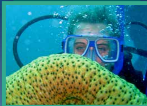
Enjoy the fun activities on board!