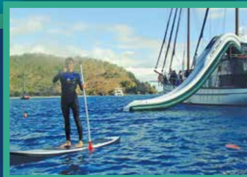
Paddle and explore the crystal waters.