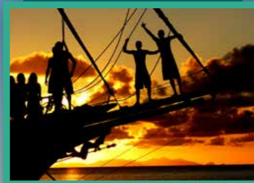
Awaken your senses.