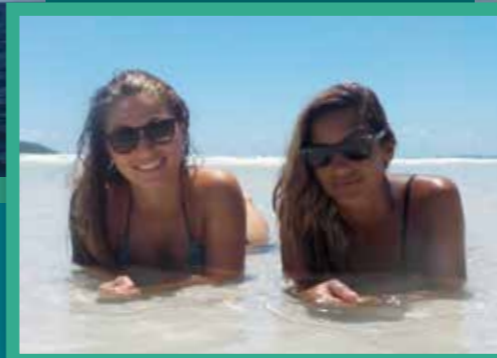
Encounter nature's precious reef life.